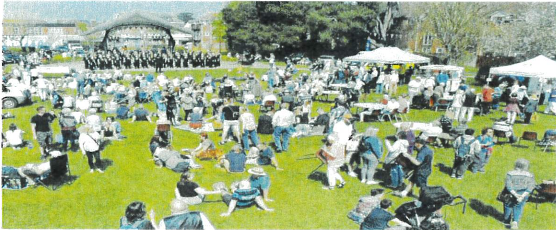
Crowds of up to 4,000 visitors were thought to have attended

As reported in the local New Milton Advertiser & Times newspaper at the time, thousands of visitors flocked to the New Milton Lions' Easter Extravaganza on 16 April to enjoy one of the town's first major public event since the pandemic ended.